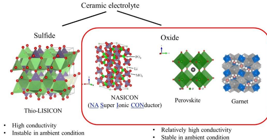
Fig. 2 Ceramic electrolytes

Ceramic solid electrolytes are categorized into oxides and sulfides (Fig. 2). We have researched oxide-based ceramic electrolytes. In the lecture, our recent research on oxide-based ceramic electrolytes are presented.